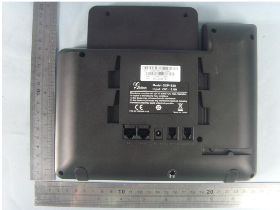
EUT- Rear View