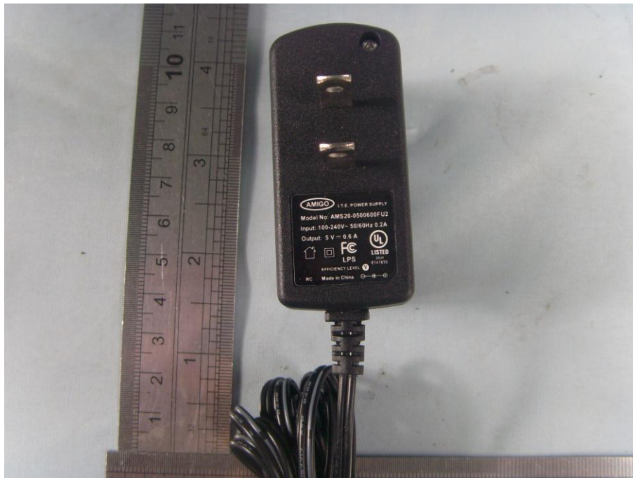
Power Adapter #3 View(Manufacturer: AMIGO)