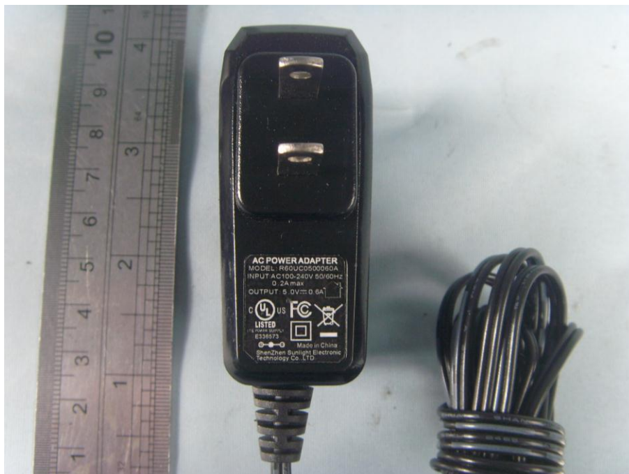
Power Adapter #4 View(Manufacturer: Sunlight)