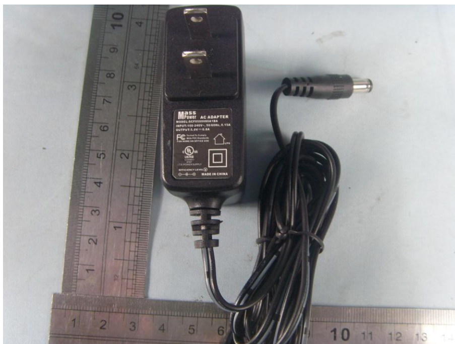
Power Adapter #1 View(Manufacturer: Mass power)