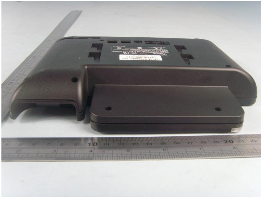
EUT- Top View