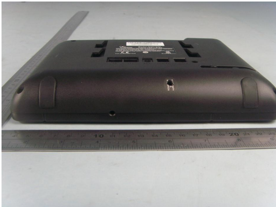
EUT- Bottom View