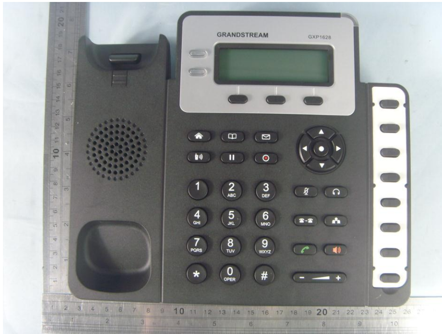
EUT- Front View