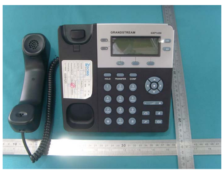
EUT- Front View