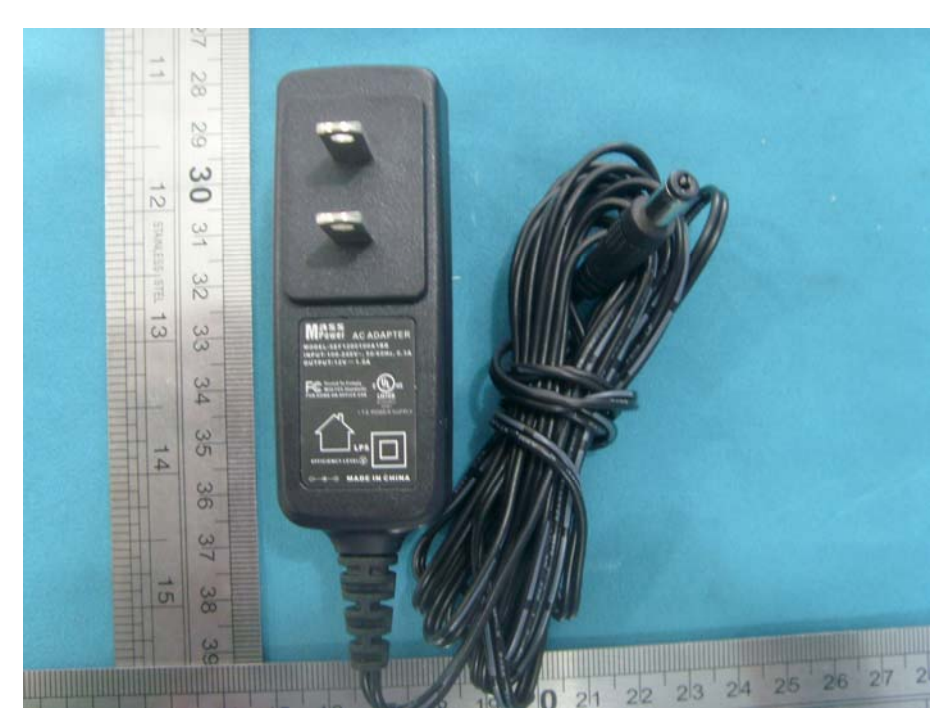
Adaptor #1 View(Manufacturer: Mass Power)