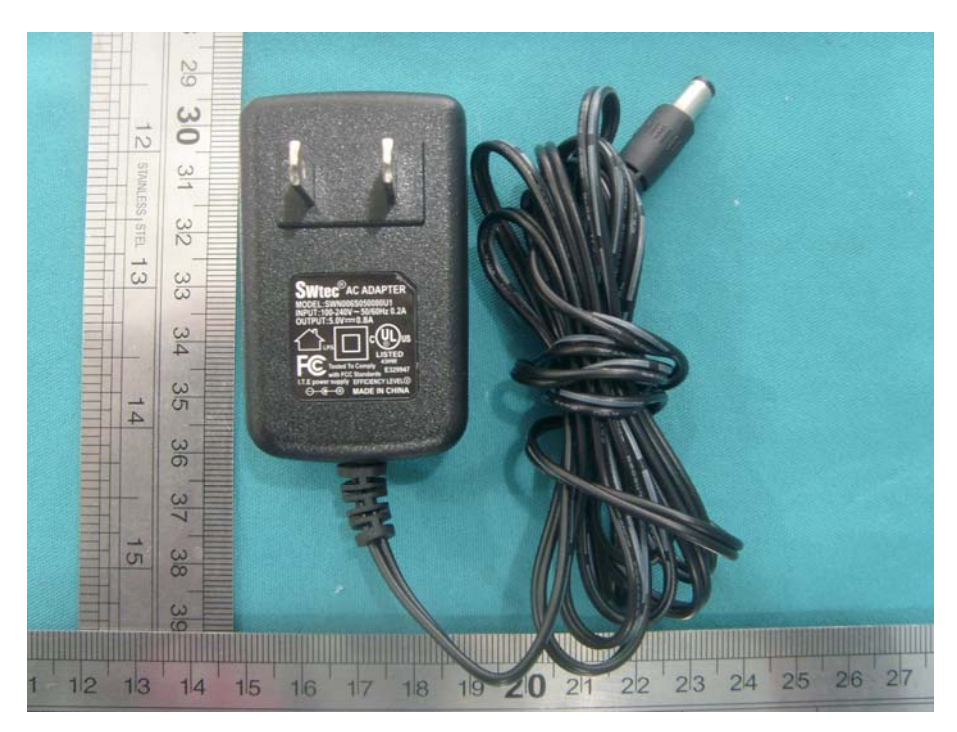
Adaptor #3 View(Manufacturer: Swtec)