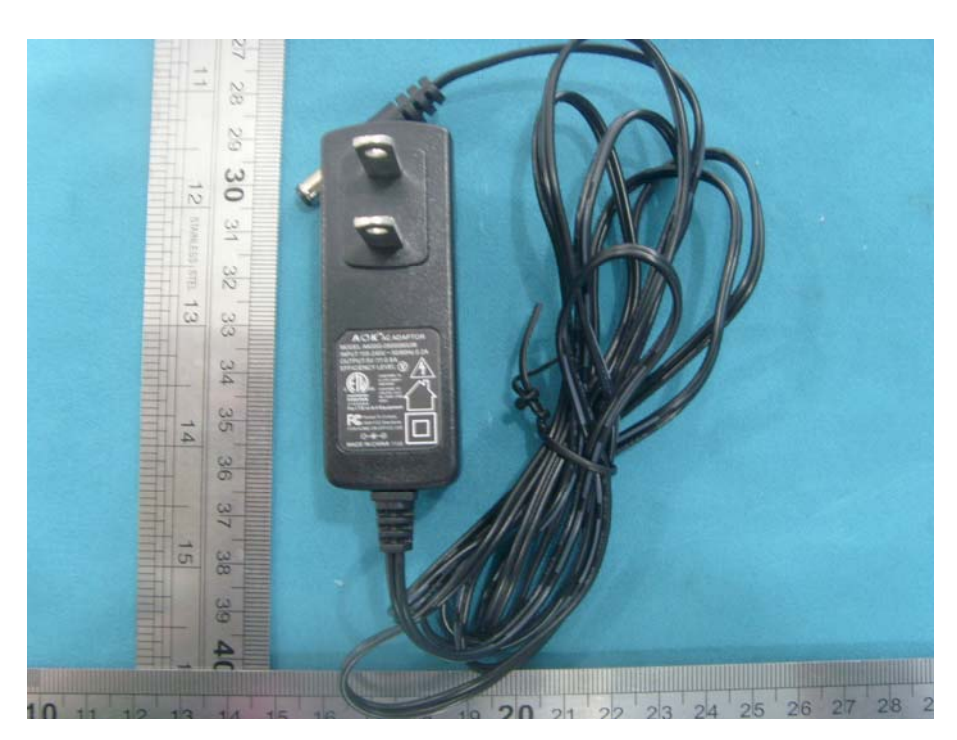
Adaptor #2 View(Manufacturer: All-Key(AK))