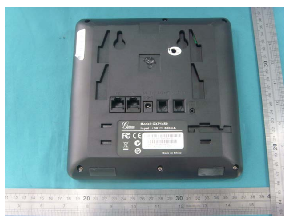
EUT- Rear View