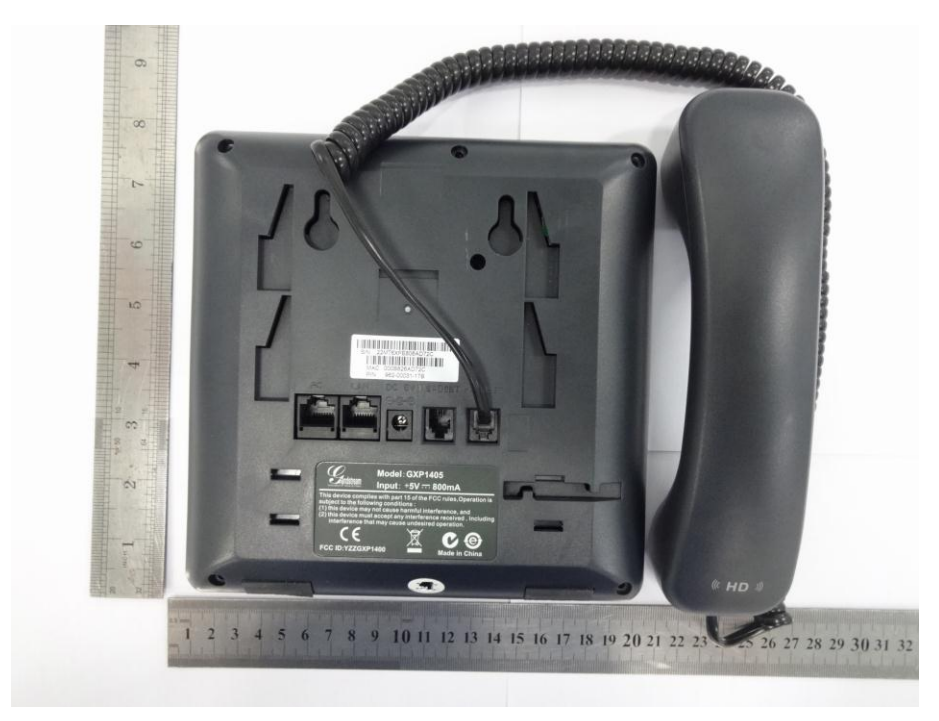
EUT- Rear View