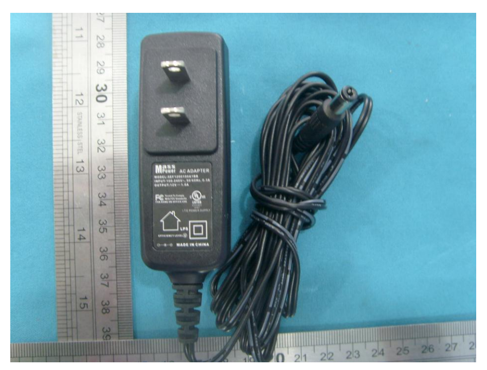
Power Adaptor #1 View(Manufacturer: Mass Power)