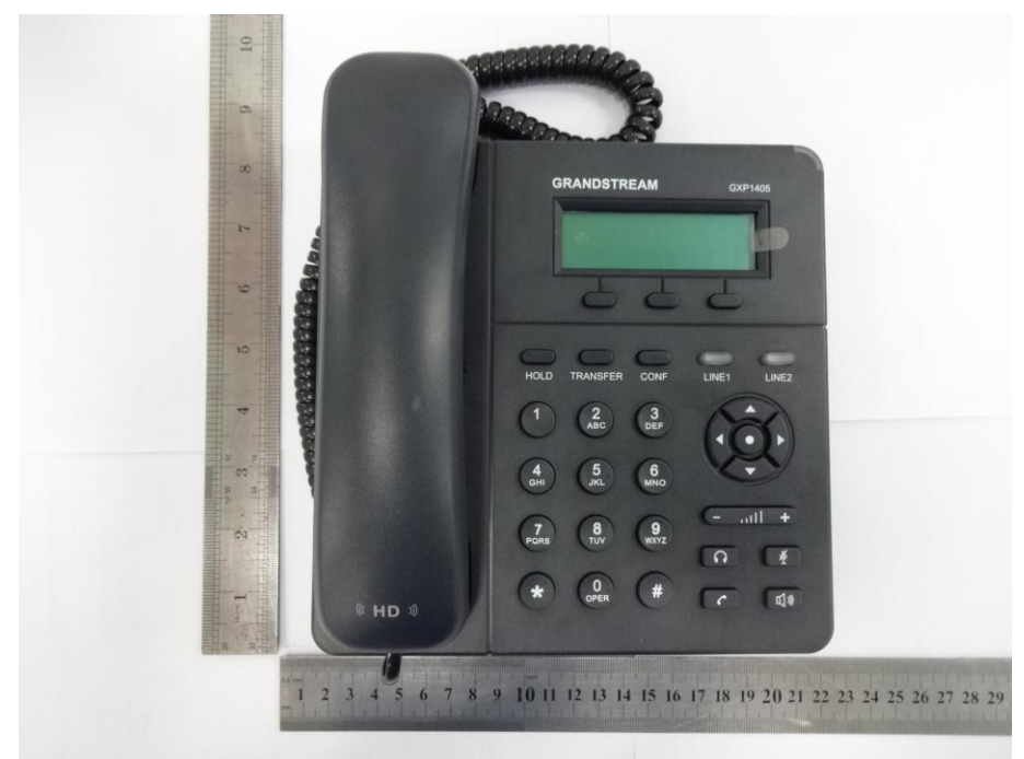
EUT- Front View