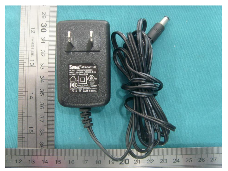
Power Adaptor #3 View(Manufacturer: SWTEC)