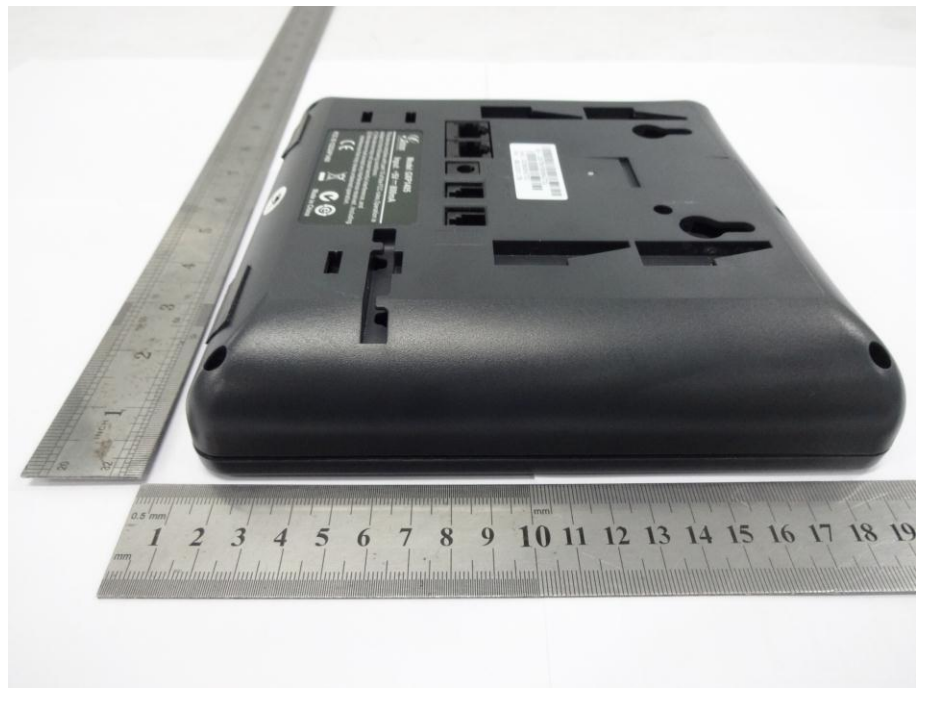
EUT- Left Side View