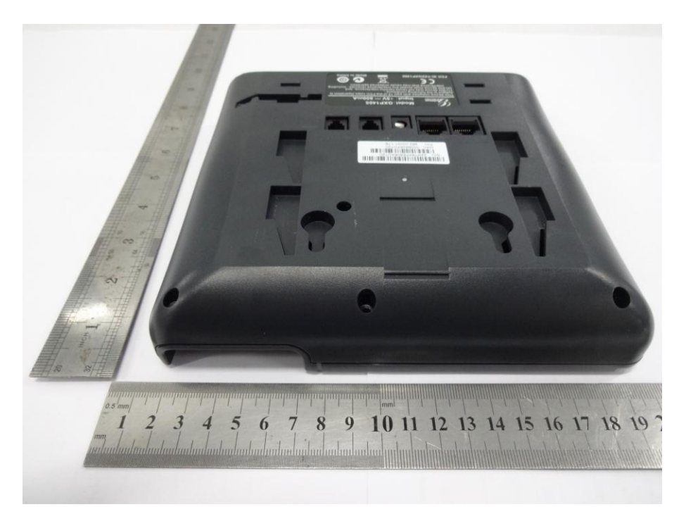
EUT- Top View