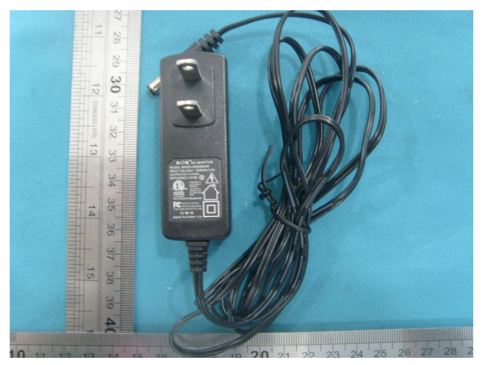
Power Adaptor #2 View(Manufacturer: All-Key)