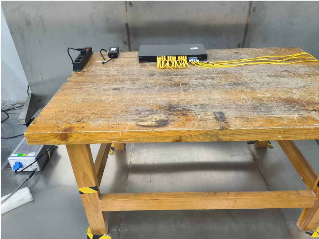
Conducted emissions side View- M3