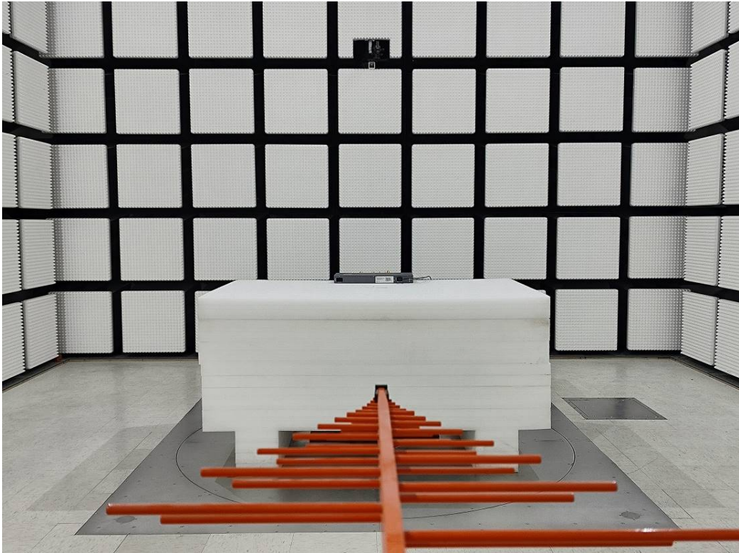
Radiated Emissions Below 1G Rear View- M1~M2