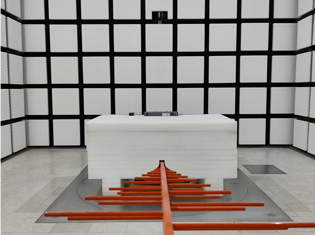
Radiated Emissions Below 1G Rear View- M3