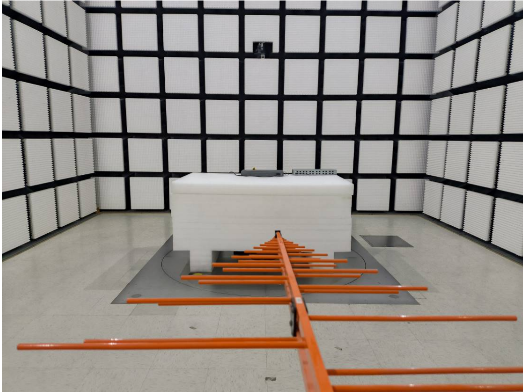
Radiated Emissions Below 1G Rear View-M1&M2