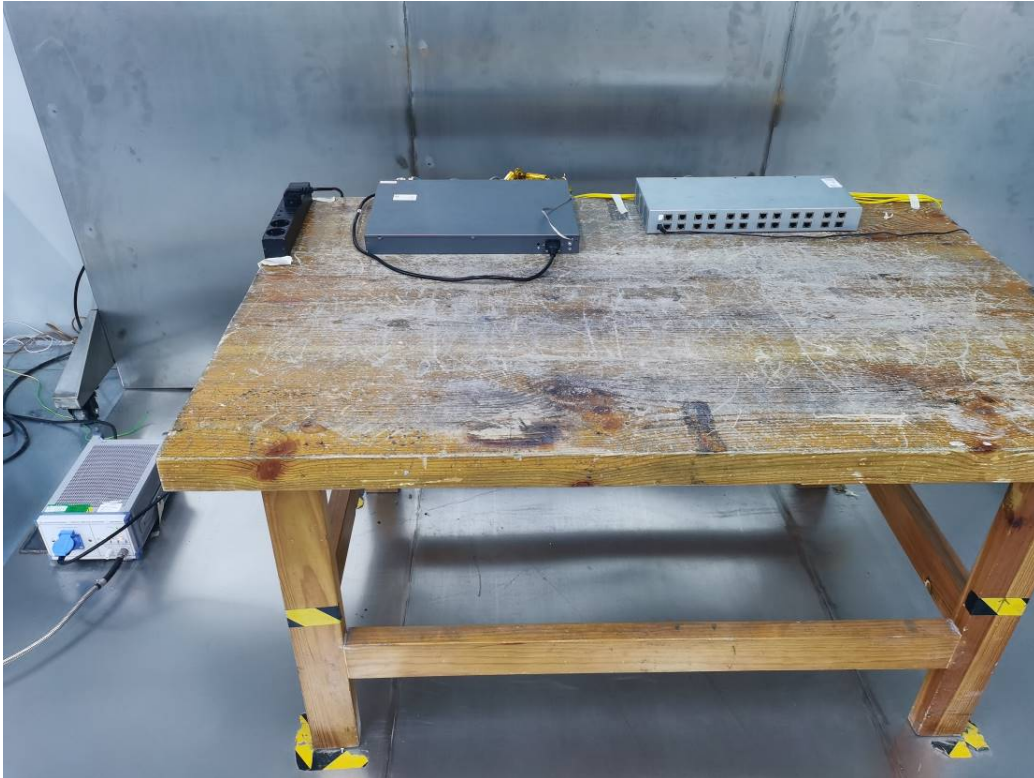
Conducted emissions side View-M1&M2