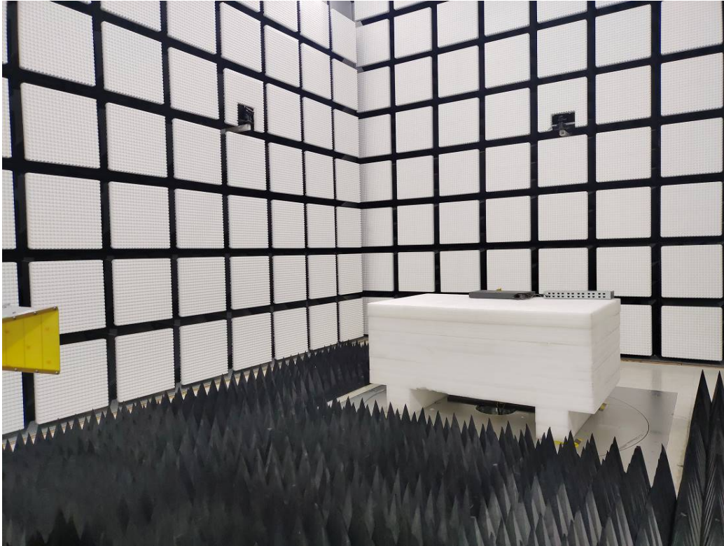
Radiated Emissions Above 1G Rear View-M1&M2