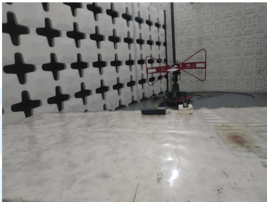
Radiated emission Test Setup-1 (30 MHz~1 GHz)