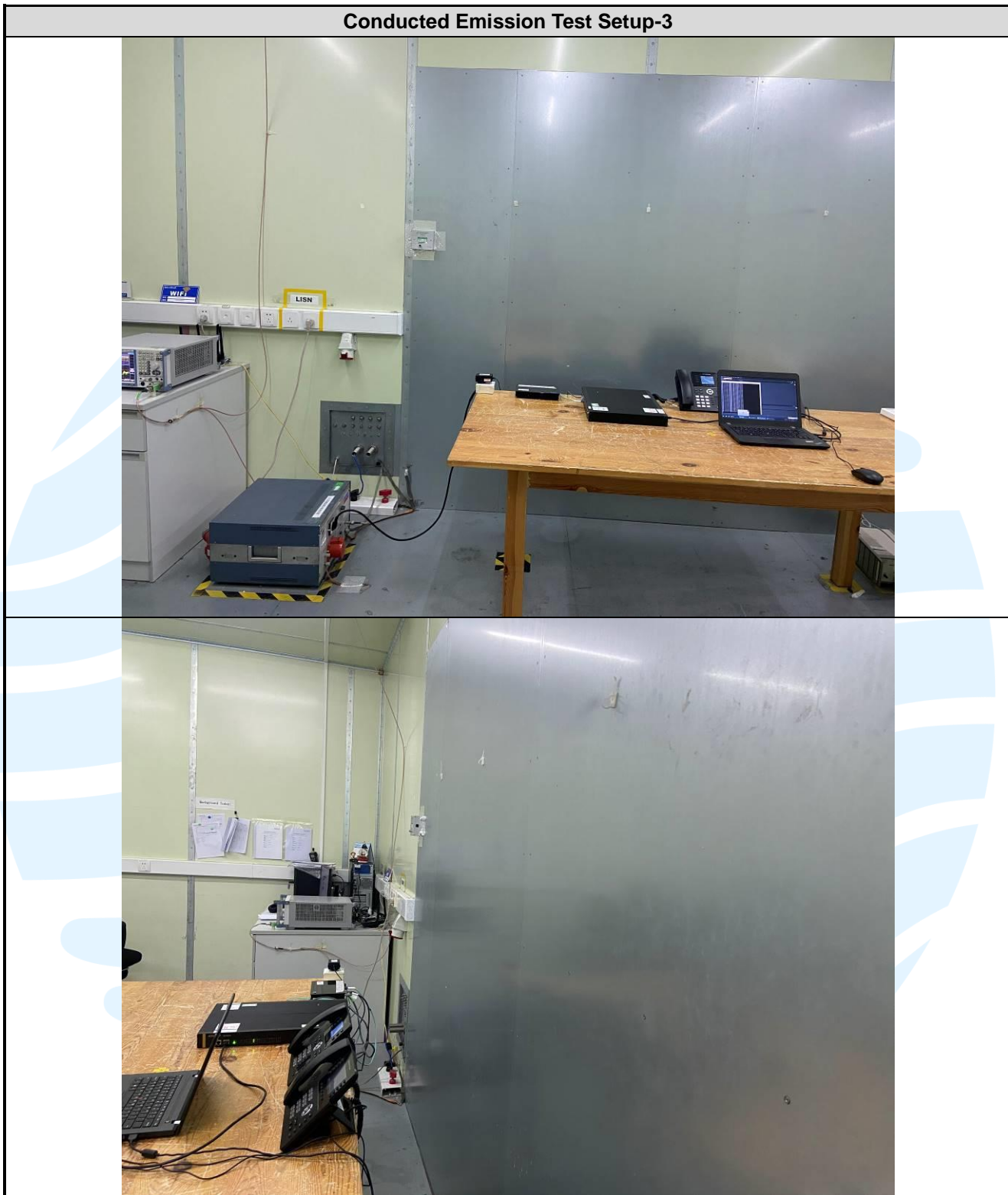
Conducted Emission Test Setup-3