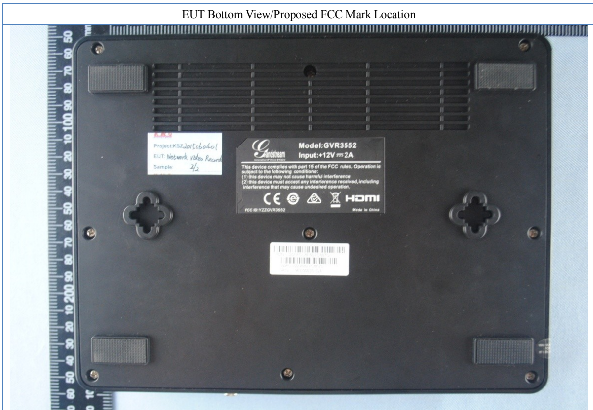
EUT Bottom View/Proposed FCC Mark Location