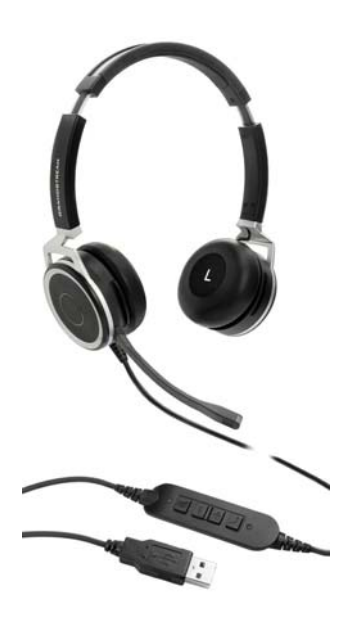
GUV3005 Advanced USB Corded Headset Quick User Guide