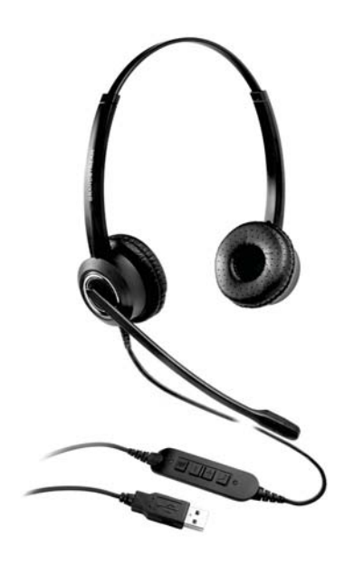
GUV3000 USB Corded Headset Quick User Guide