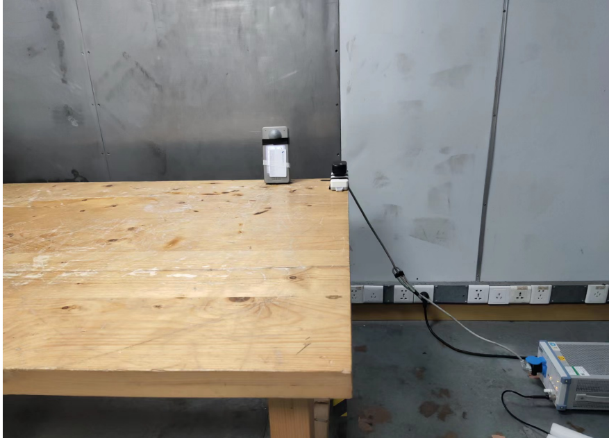
Photo of Conducted Emission Measurement Powered by adapter