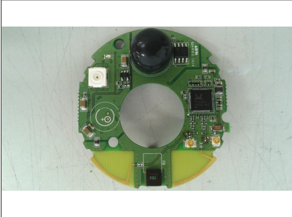
Bottom view of Main PCB