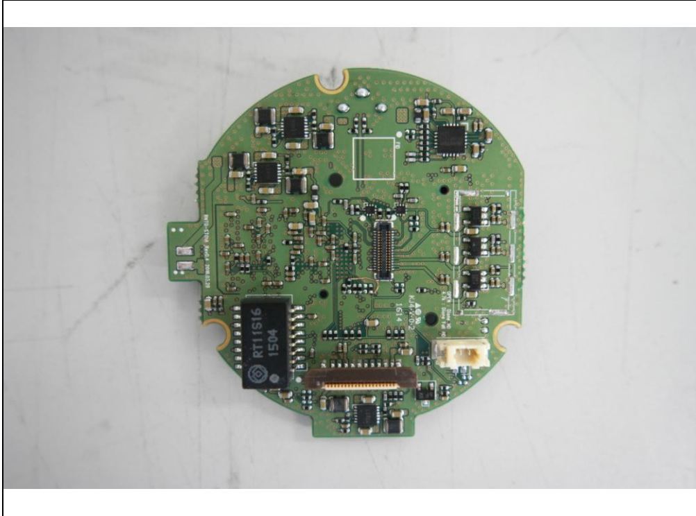
Bottom view of Sub PCB