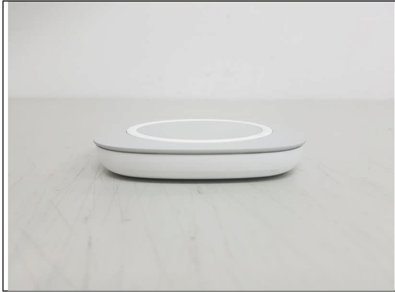
Rear view of EUT