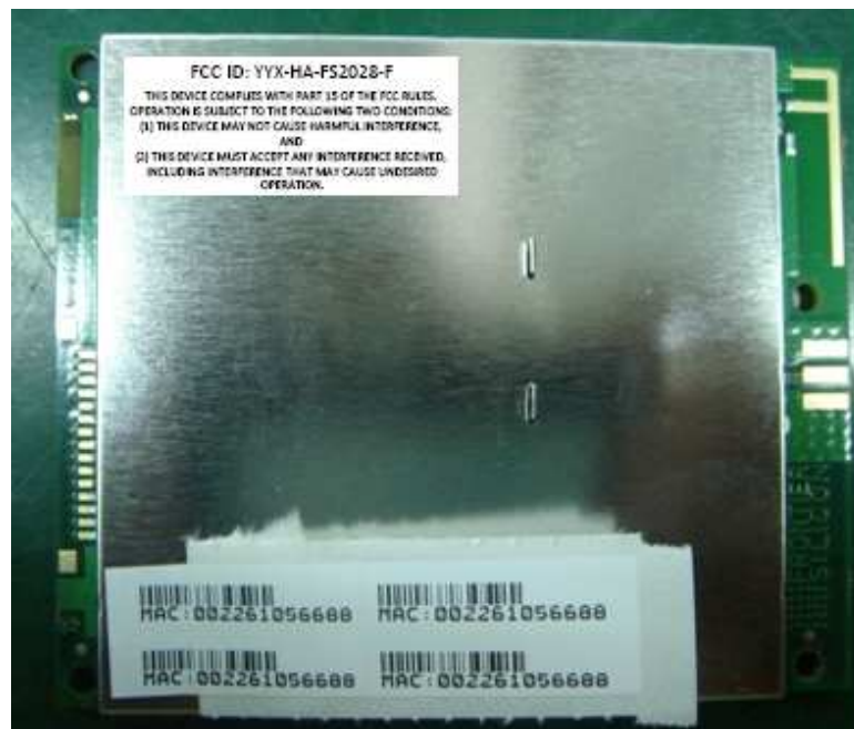
Figure 2 Venice8

Note: the screening can lid must be clean with a non greasy surface.