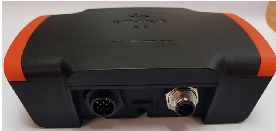
4. Connectors 1