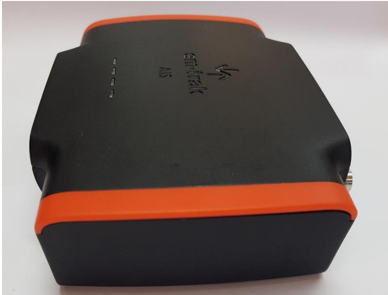
3. Side 2