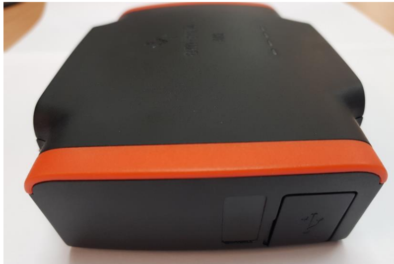
2. Side 1