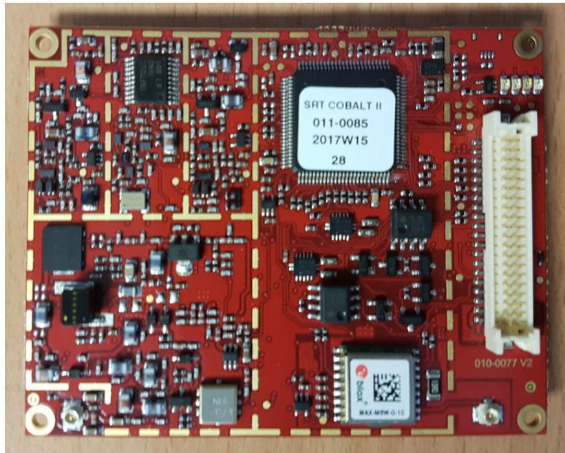
1. PCB Top