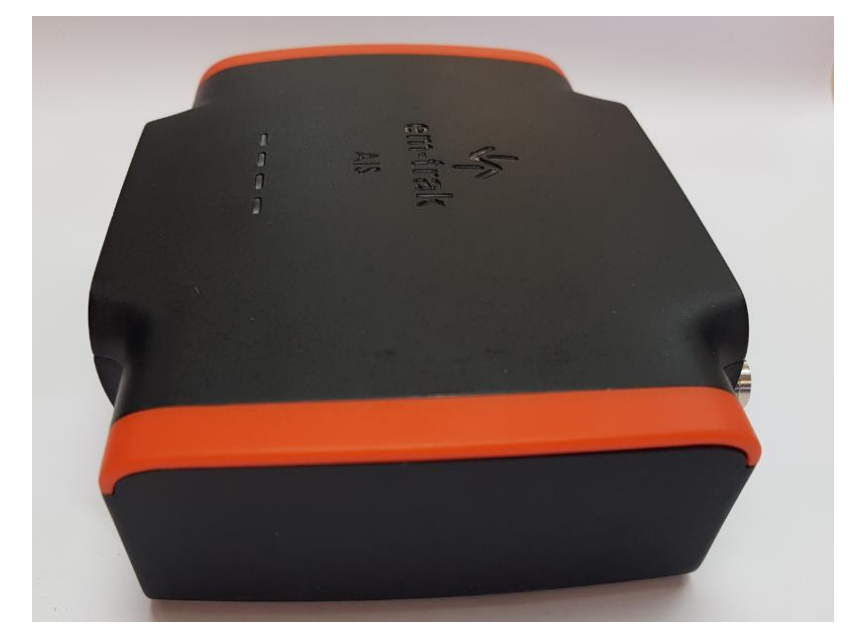
3. Side 2