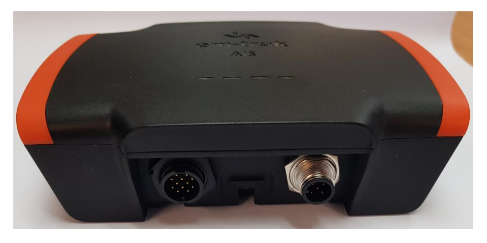
4. Connectors 1