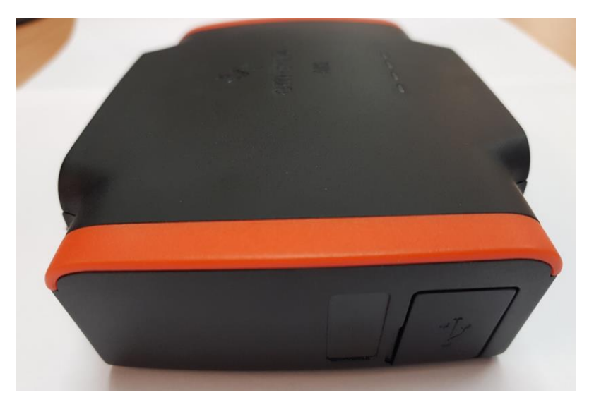
2. Side 1