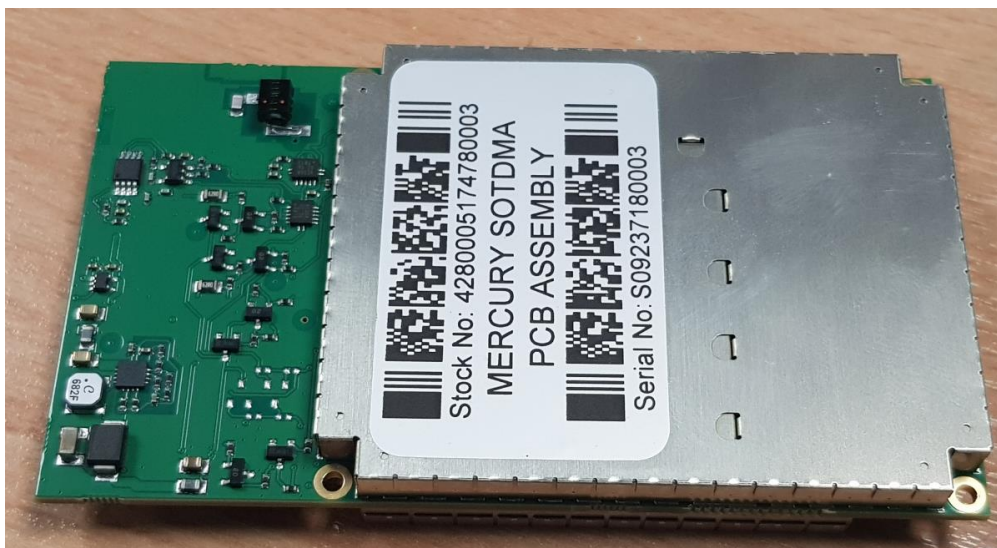
2. PCB Bottom