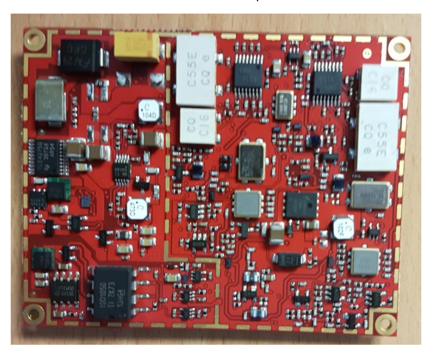
2. PCB Bottom