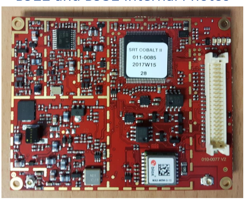
1. PCB Top