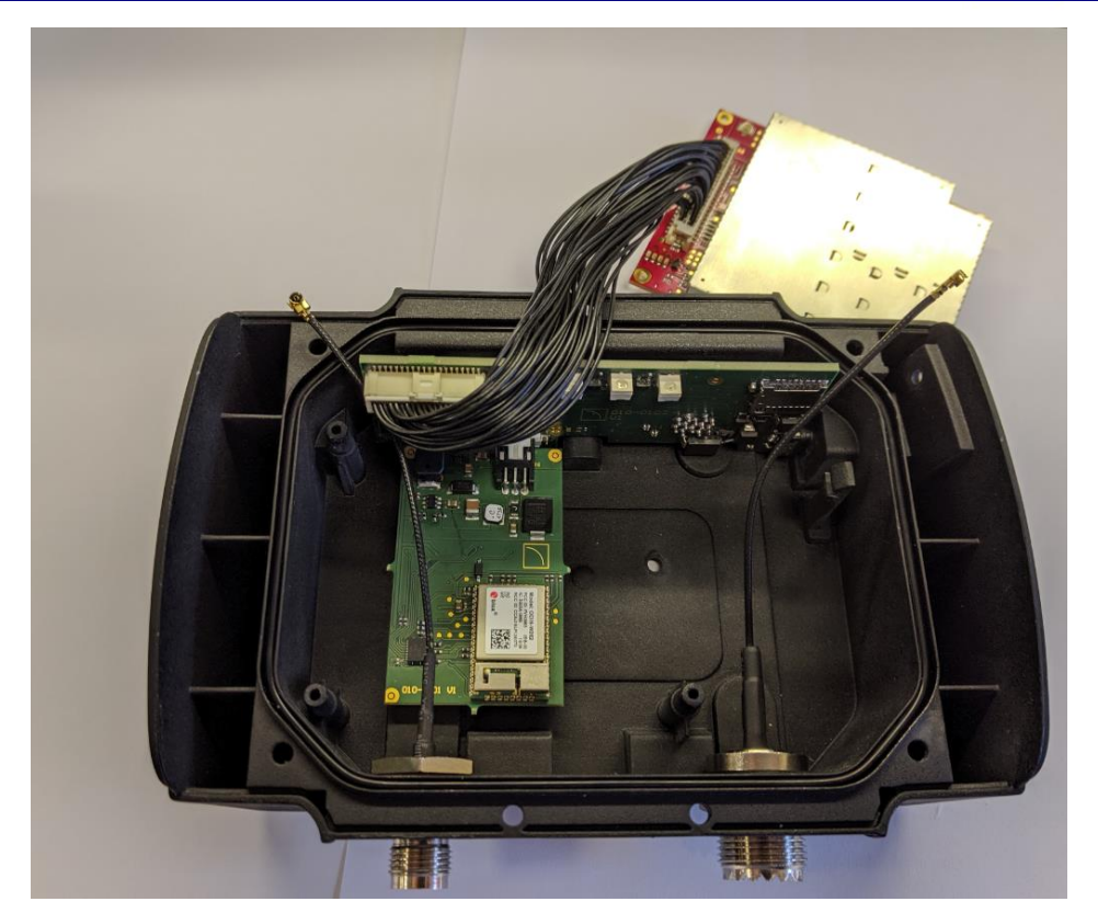
3. WiFi Module Internal