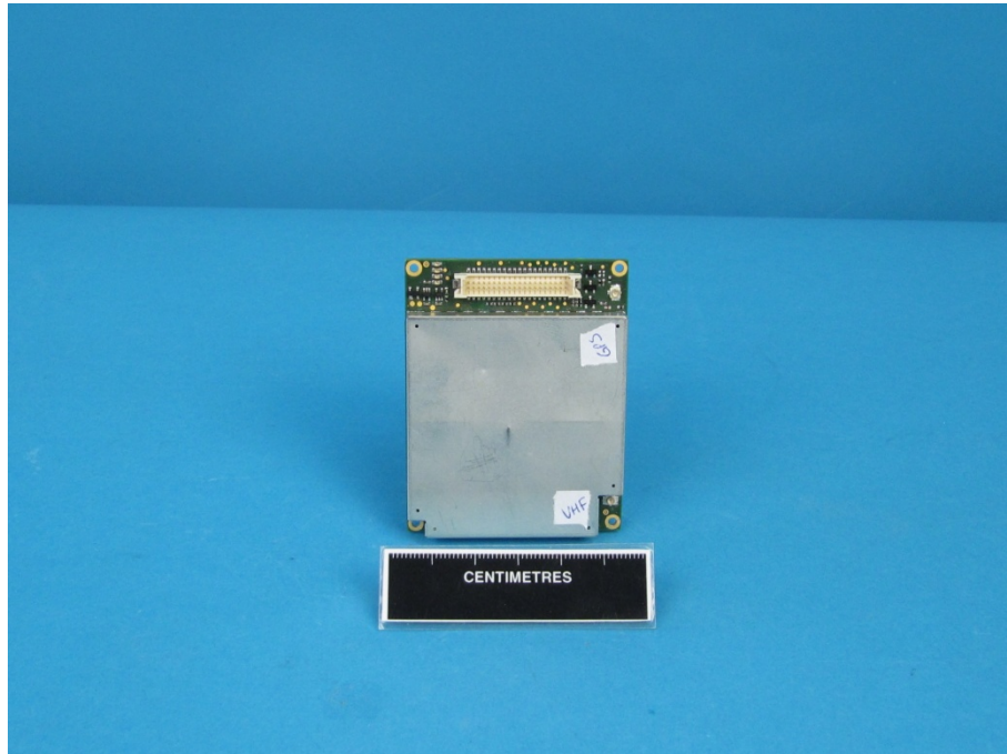
Equipment Under Test

The Equipment Under Test (EUT) was a SRT Marine Technology Ltd Cobalt - Class B AIS as shown in the photograph below. A full technical description can be found in the manufacturer's documentation.