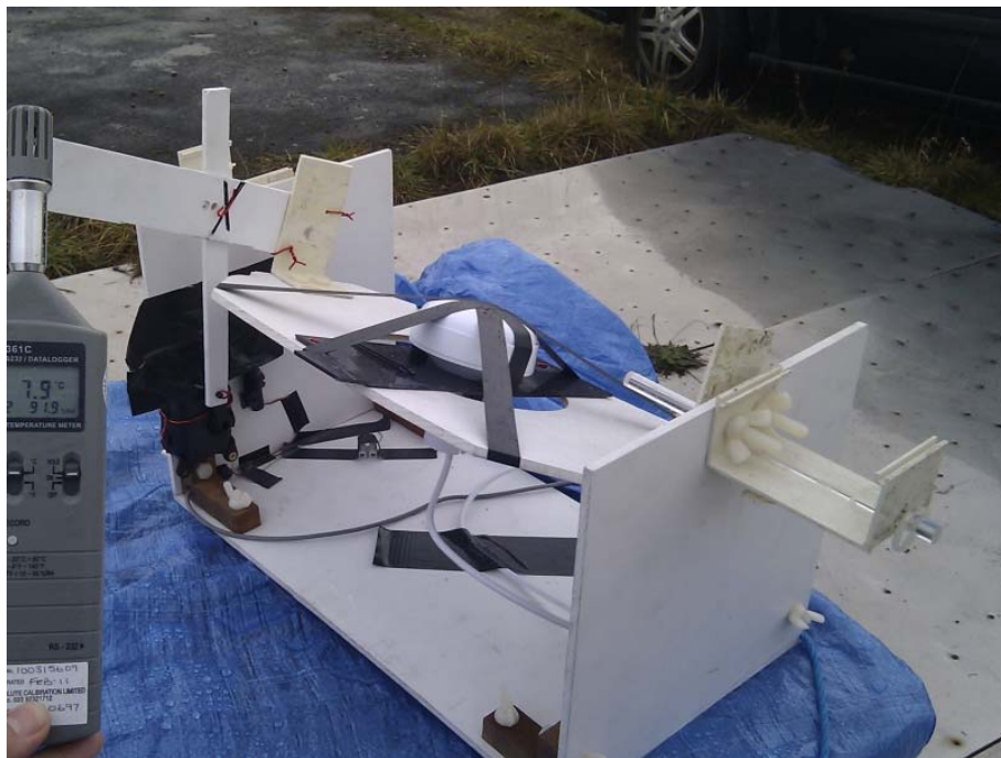
Test Setup (Angular Movement Extreme 2)