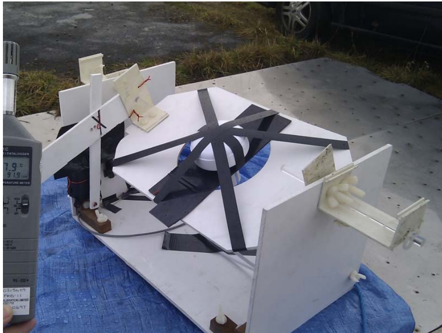
Test Setup (Angular Movement Extreme 1)