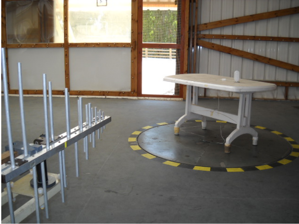
Photograph No.1 Setup for carrier field strength measurements at the OATS