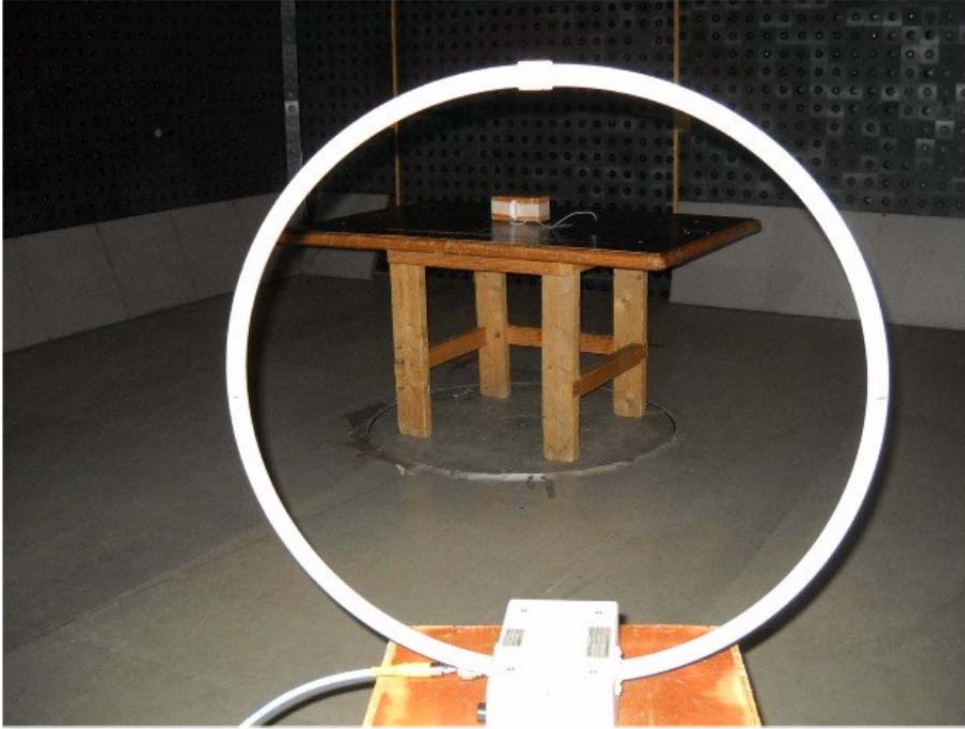
Photograph No.1 Setup for spurious emission field strength measurements in the anechoic chamber below 30 MHz