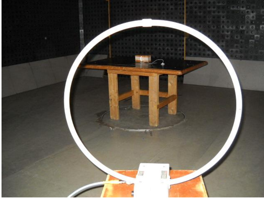
Photograph No.1 Setup for spurious emission field strength measurements in the anechoic chamber below 30 MHz