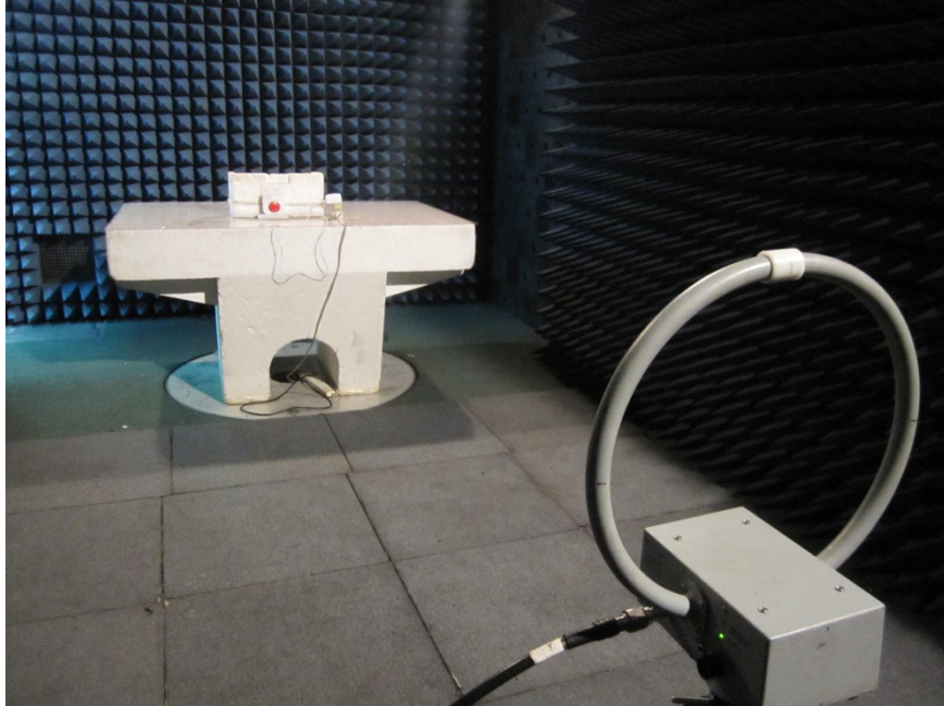
Photograph No.1 Setup for spurious emission field strength measurements in the anechoic chamber below 30 MHz