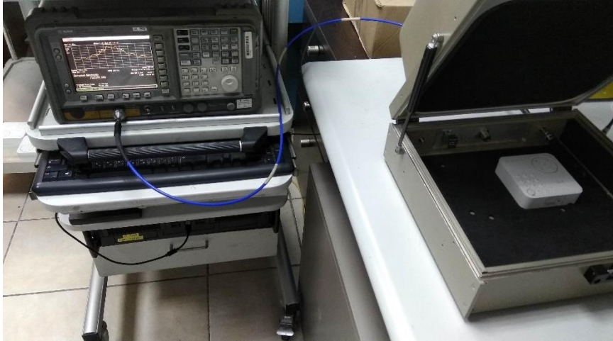
Photograph 1 Setup for OBW measurements