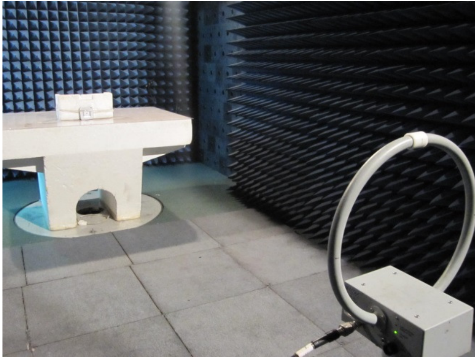
Photograph No.1 Setup for spurious emission field strength measurements in the anechoic chamber below 30 MHz