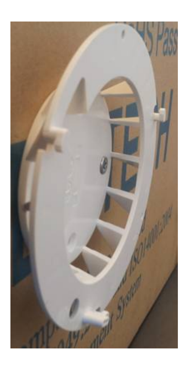
Photograph No.1 ES700SK2 smoke detector wall mount

The sample of the detector installation on the wall is shown in the following photographs No 3 to No.5.