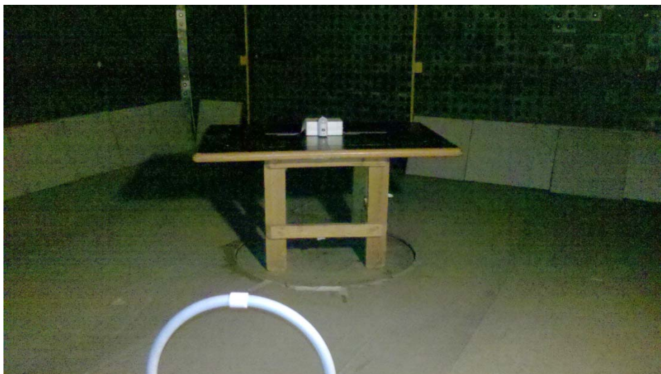
Photograph No.1 Setup for spurious emission field strength measurements in the anechoic chamber below 30 MHz