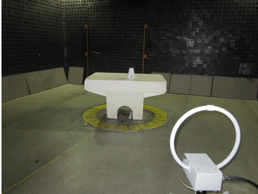
Photograph No.1 Setup for spurious emission field strength measurements in the anechoic chamber below 30 MHz