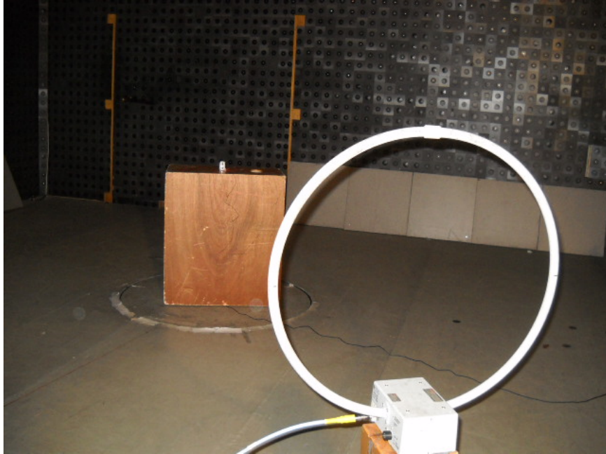
Photograph No.1 Setup for spurious emission field strength measurements in the anechoic chamber below 30 MHz