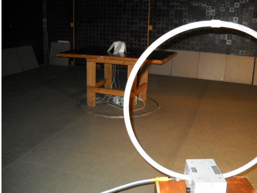
Photograph No.1 Setup for spurious emission field strength measurements in the anechoic chamber below 30 MHz