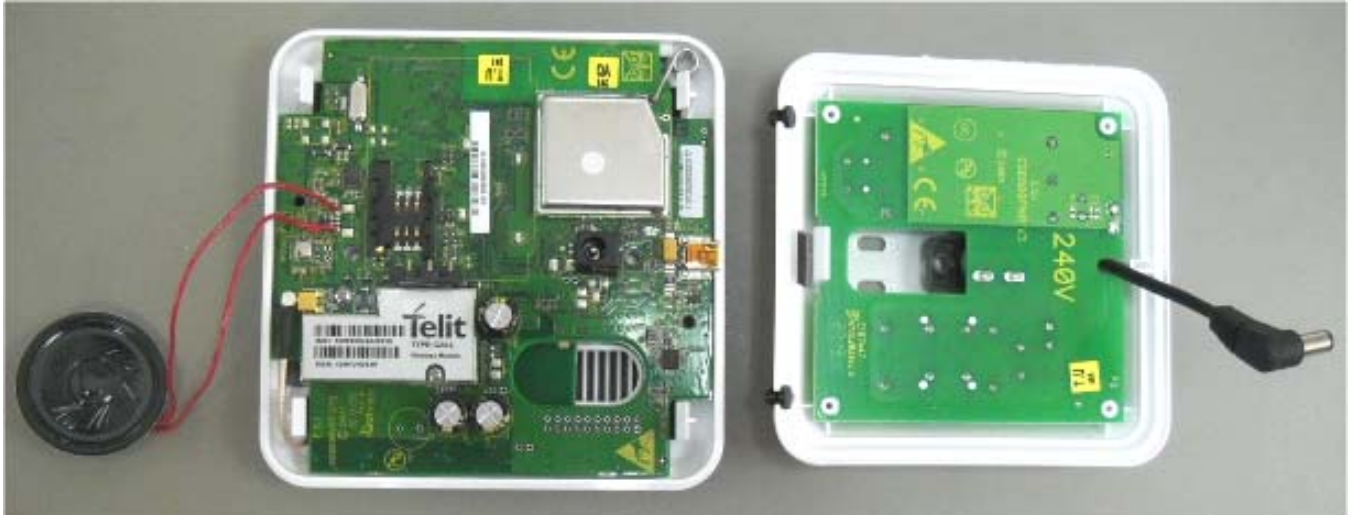
Photograph No.1 ES650VSF control panel internal view