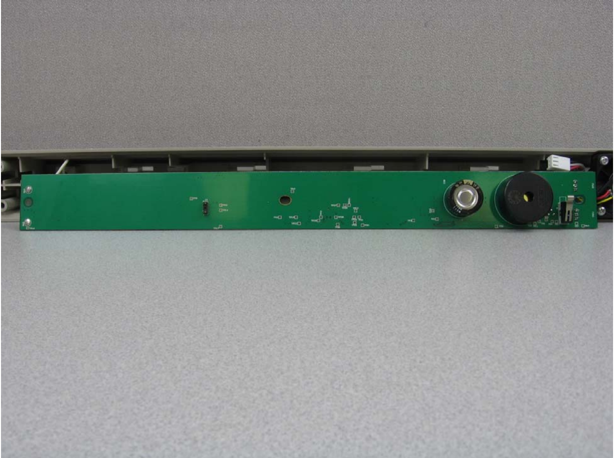
Figure 2: Internal Photo - Control Board