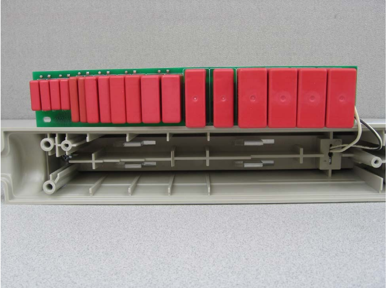
Figure 5: Internal Photo - High Voltage Board