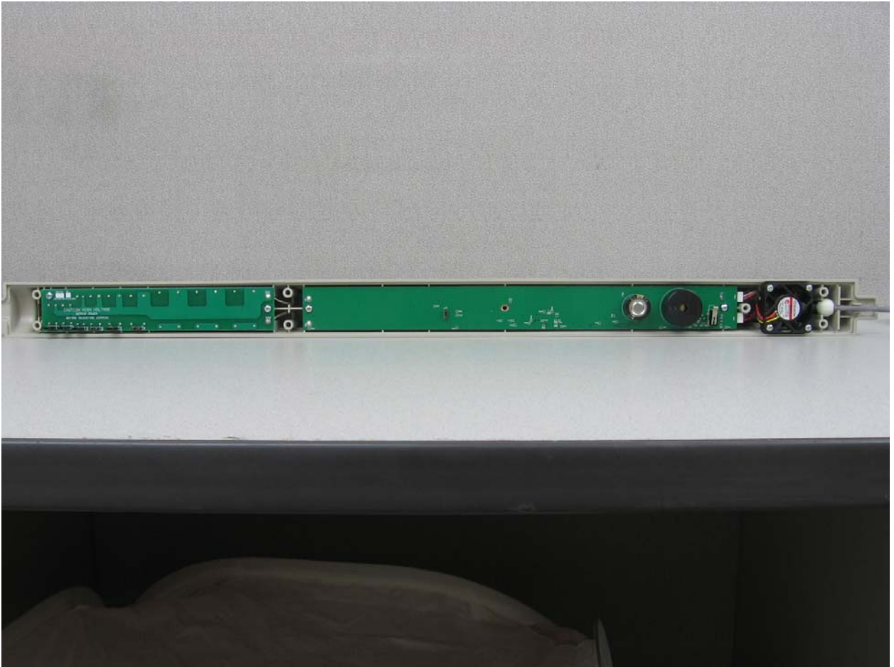
Figure 1: Internal Photo