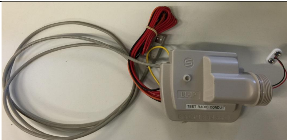
Photography of EUT