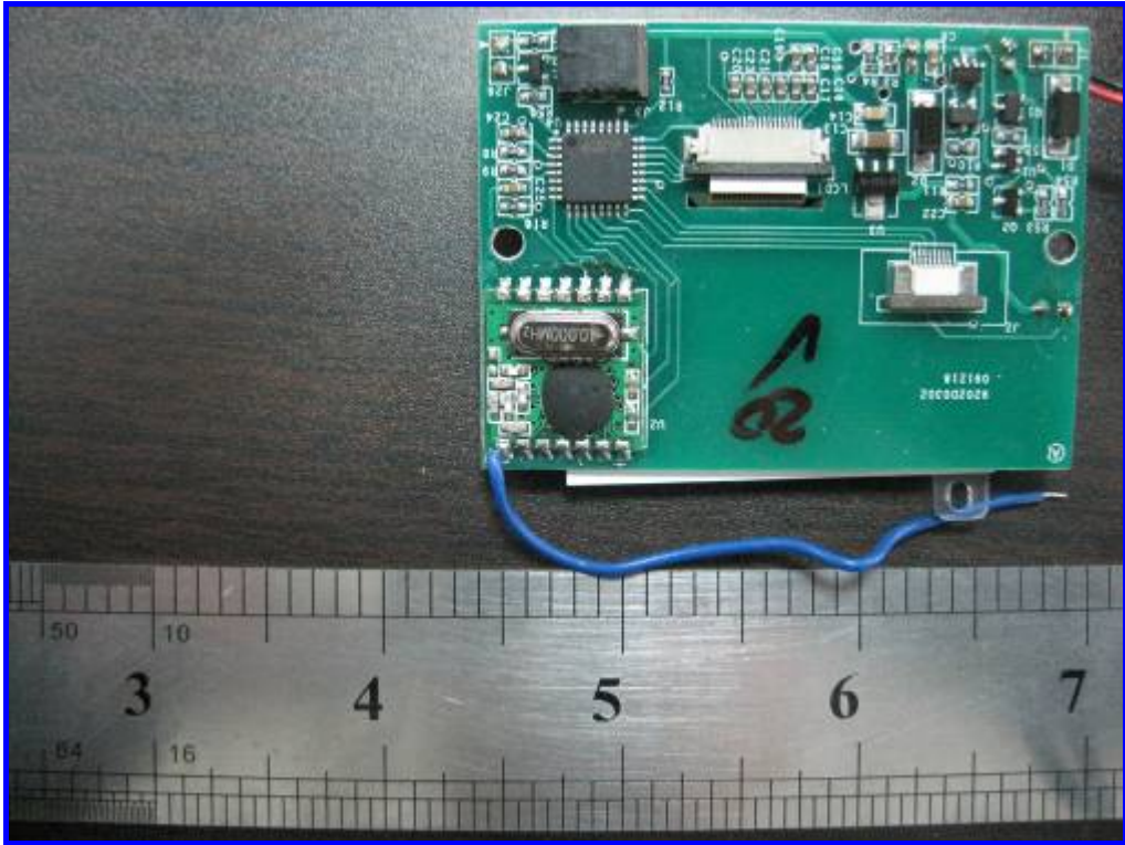
Front View of mainboard PCB