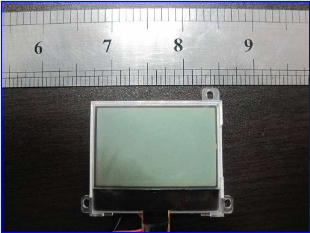
Front View of LCD Panel