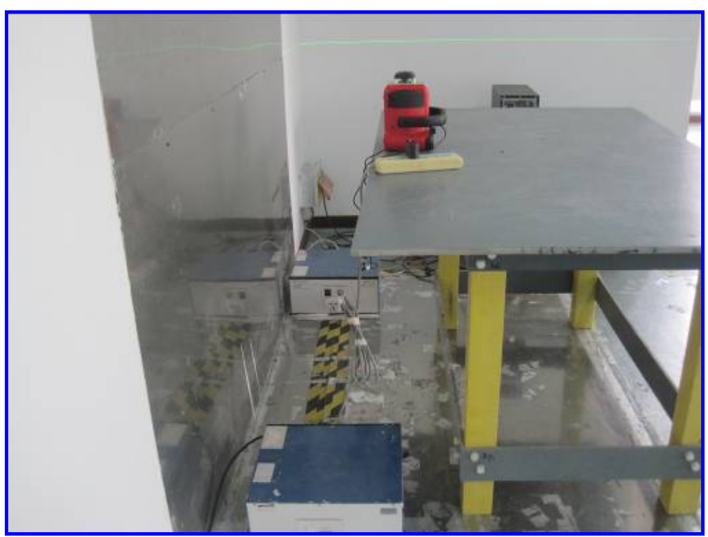
Side View of Conduced Emission Test Setup