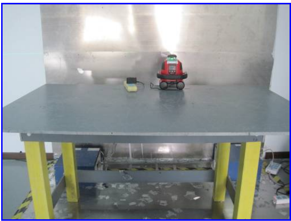
Front View of Conduced Emission Test Setup

Serial#: 10021005-1 Issue Date: 29 October 2010 Page: 32 of 51