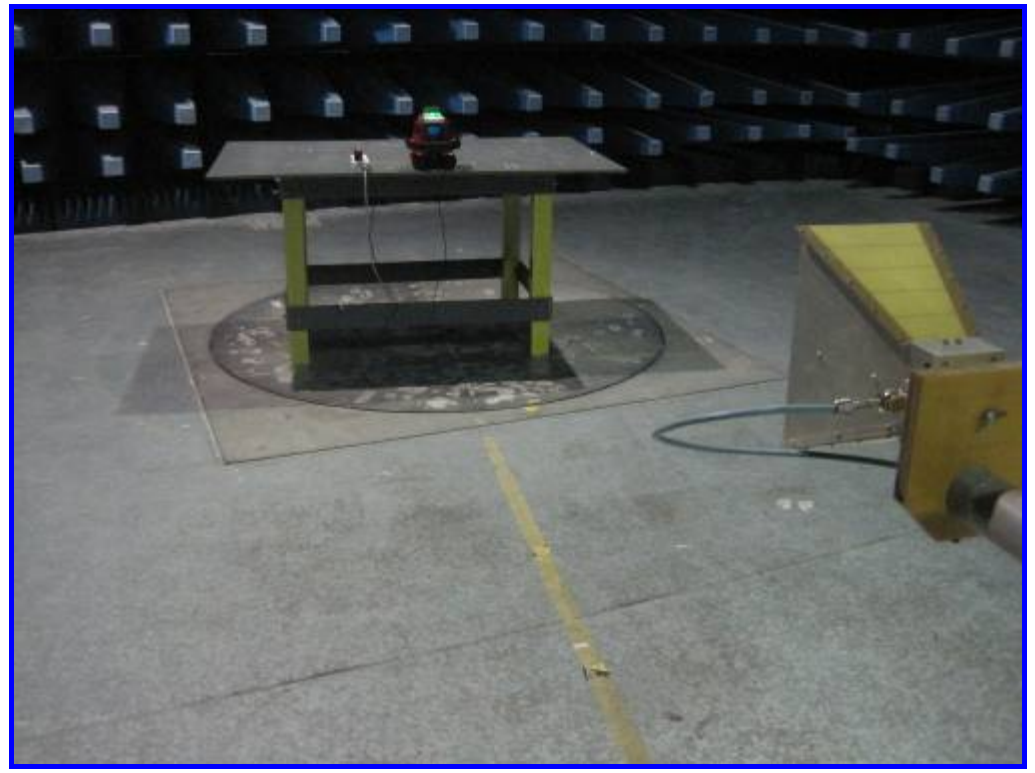
Front View of Radiated Emission Test Setup above 1GHz