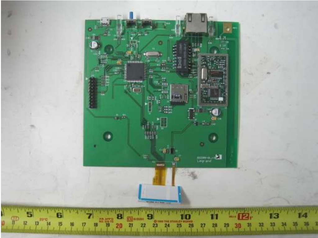
Main PCB – Component View