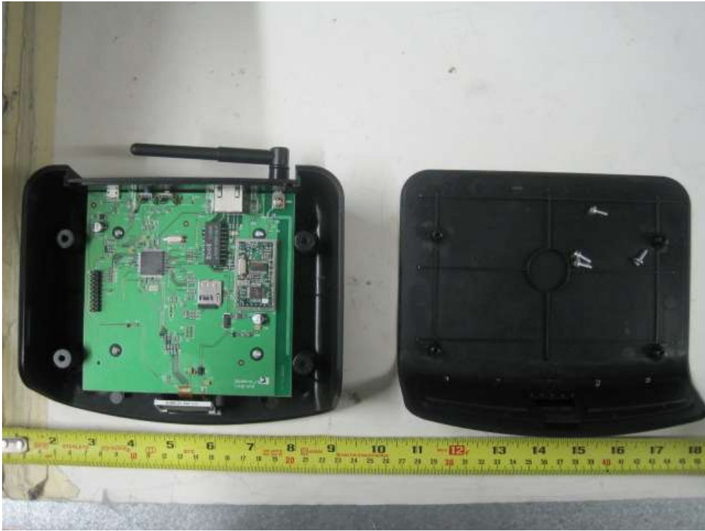
Main PCB – Chassis