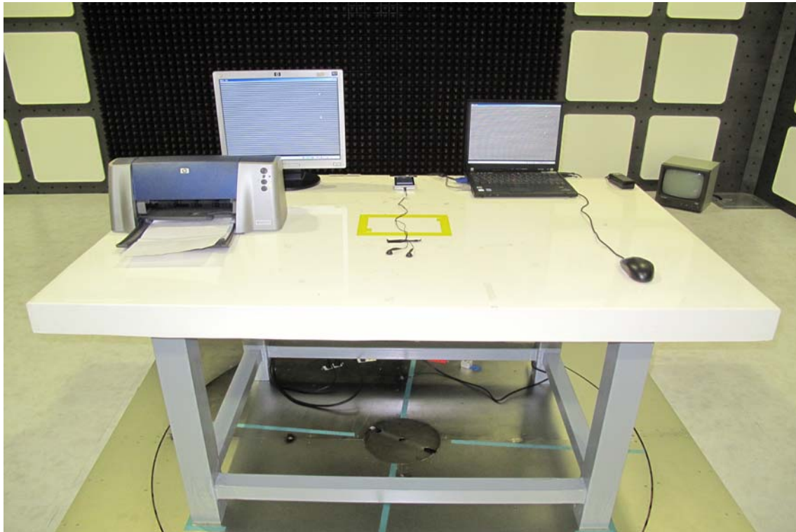
Radiated Emission Test Setup Photo (config 3)