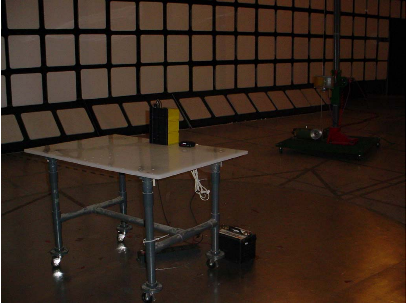
Radiated Emissions @ 3 m – Orthogonal Position 3