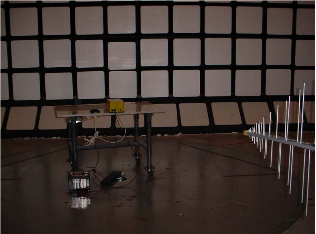
Radiated Emissions @ 3 m – Orthogonal Position 1