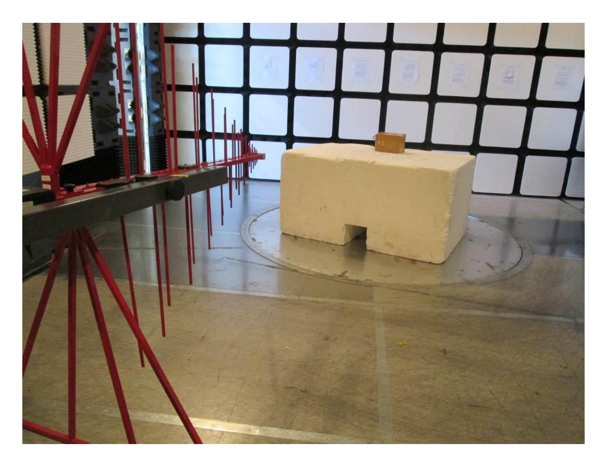
Test setup photo 2 Radiated measurements, 30 MHz – 1 GHz