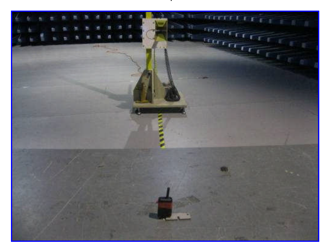
Radiated Emission Test Setup Front View Above 1GHz