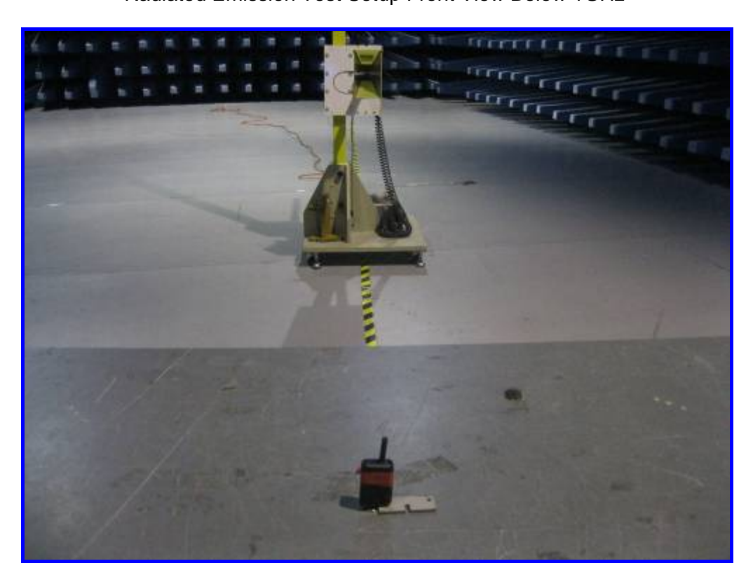
Radiated Emission Test Setup Front View Above 1GHz