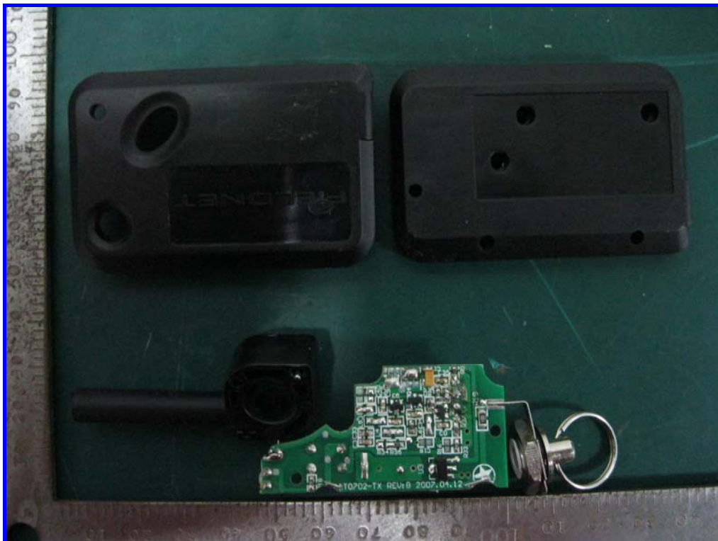
Rear View of Main PCB Board