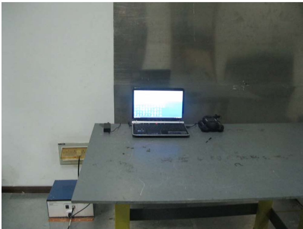
Conducted Emissions Setup Front View