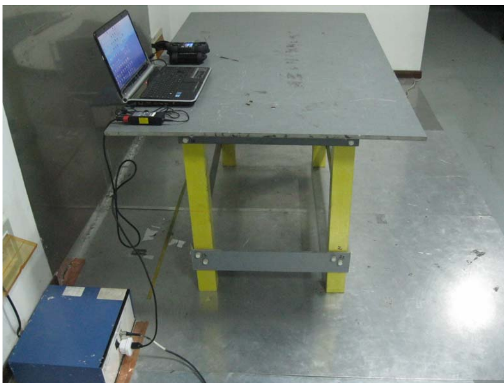
Conducted Emissions Setup Side View