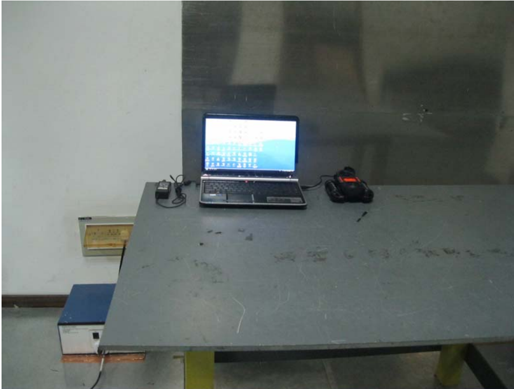
Conducted Emissions Setup Front View