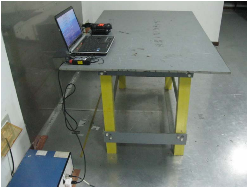
Conducted Emissions Setup Side View