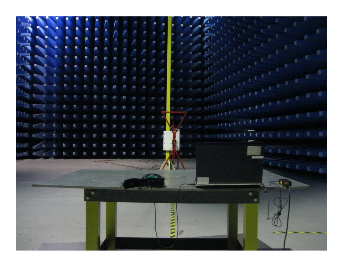
Radiated Emissions Setup Rear View