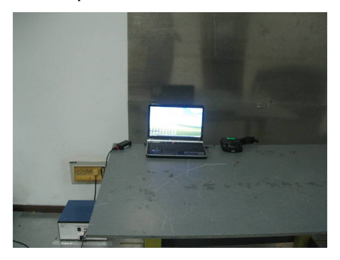
Conducted Emissions Setup Front View