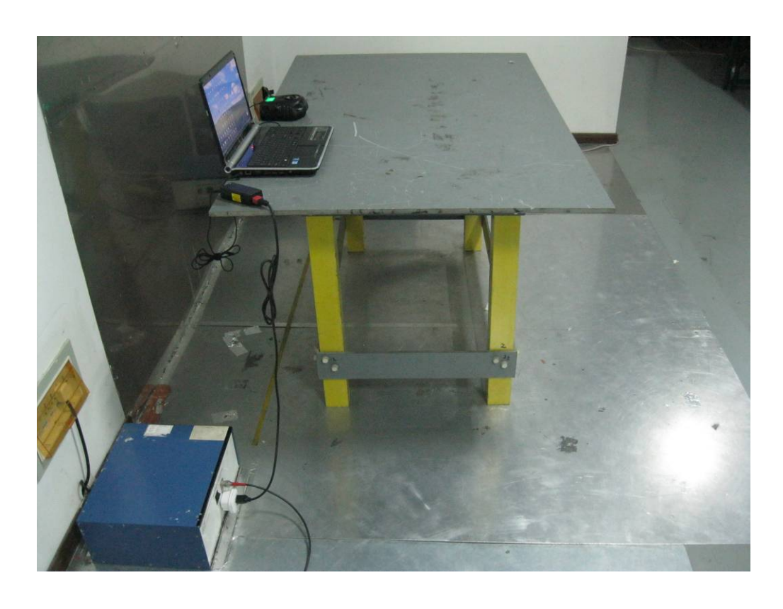
Conducted Emissions Setup Side View