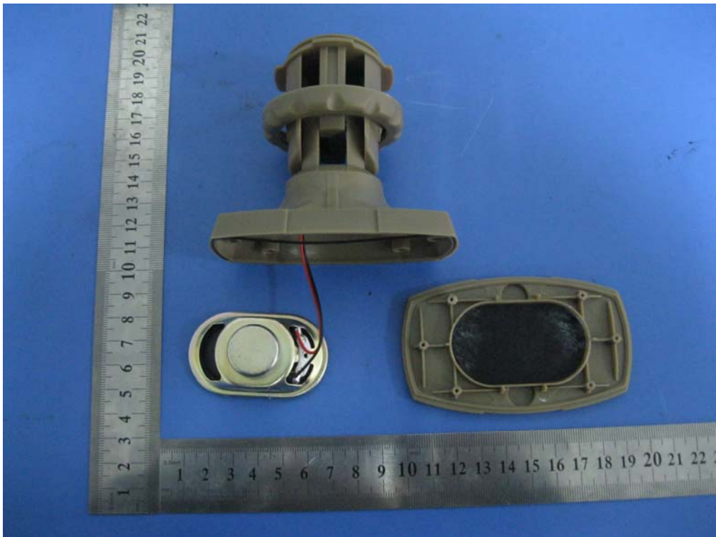
Rear View of Speaker