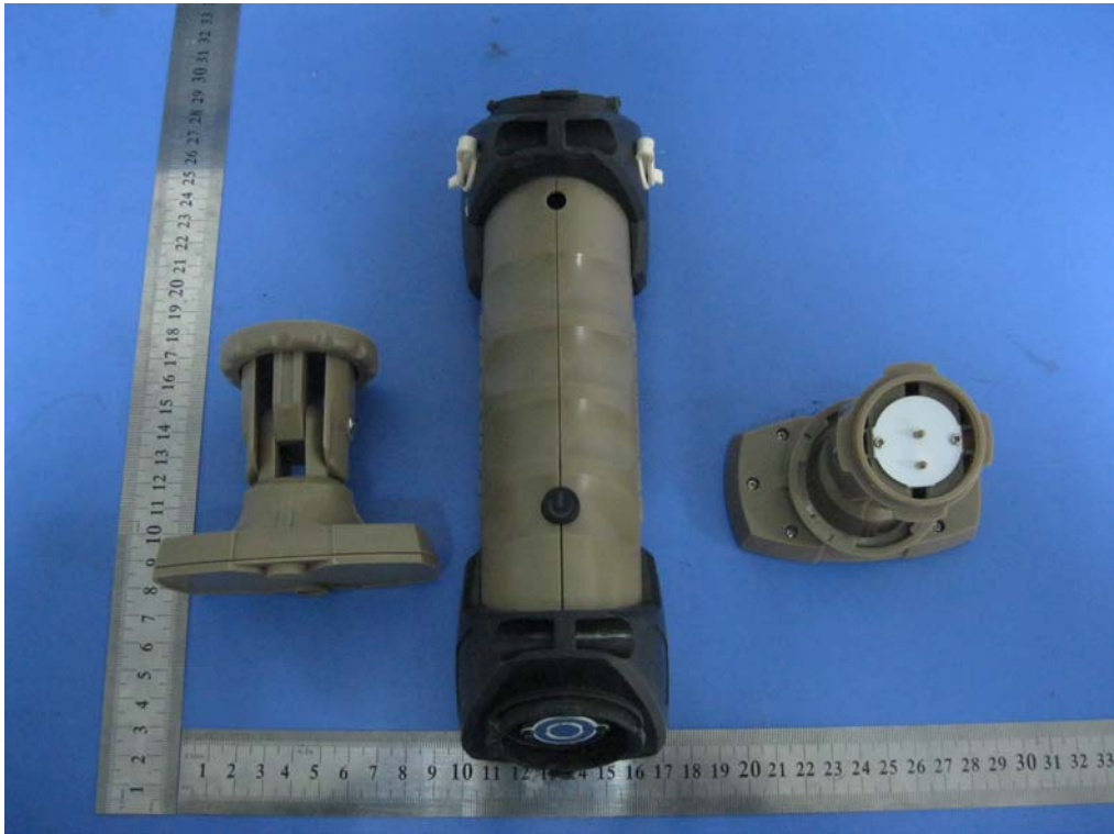
EUT – Inside View 1#