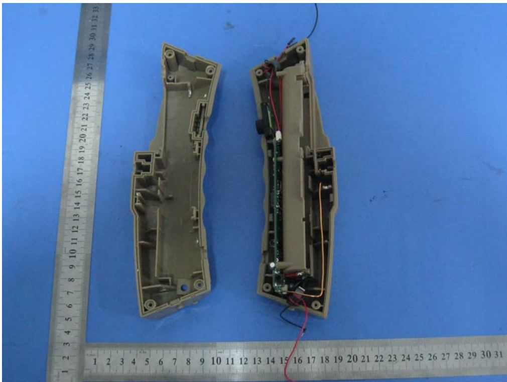
Front View of PCB Board