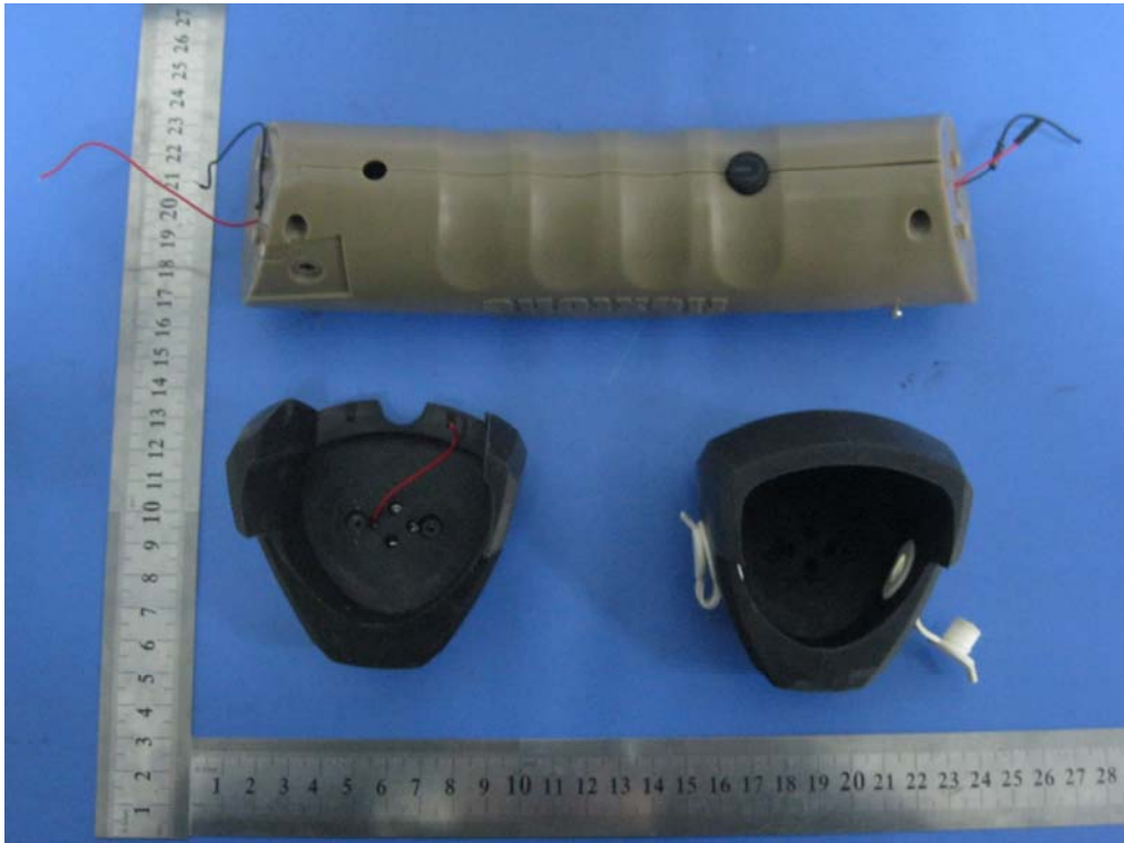
EUT – Inside View 2#