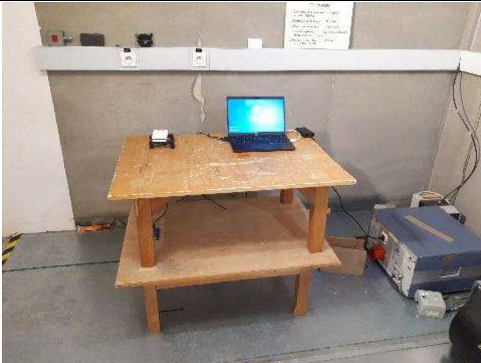
Photograph for AC Power Line Conducted Emissions (Front view)