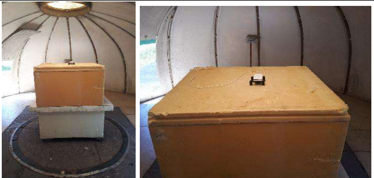
Photograph for Transmitter Radiated Emission