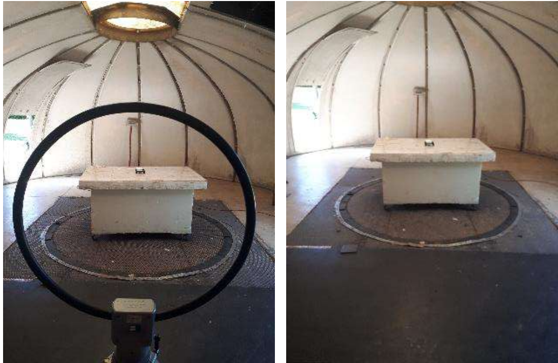
Photograph for Transmitter Radiated Emission