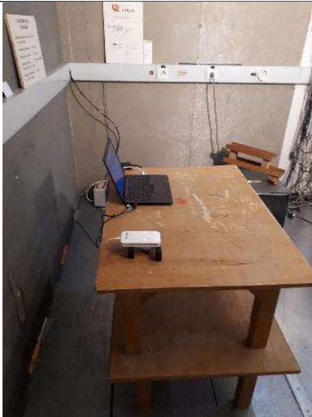
Photograph for AC Power Line Conducted Emissions (Rear view)