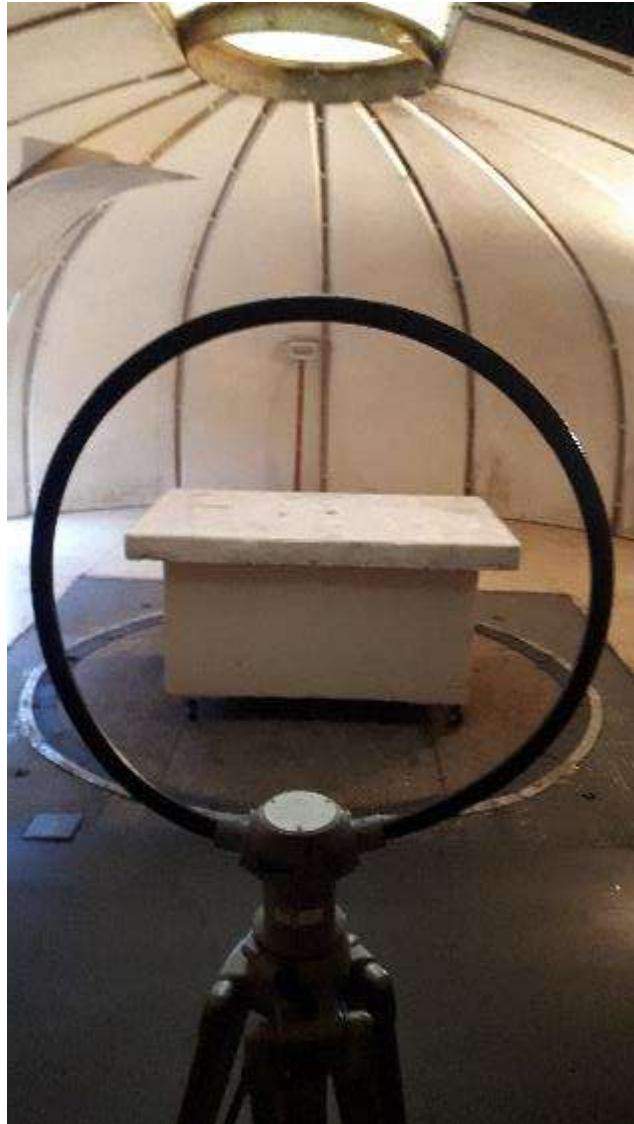
Photograph for Unwanted Emission in restricted frequency bands