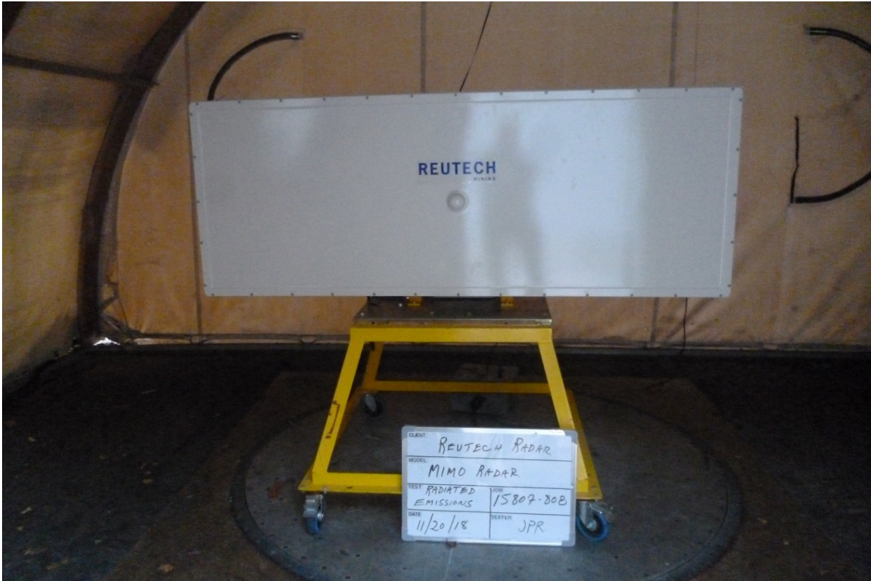
Representational: measurements were collected with the device on a non-metallic table.